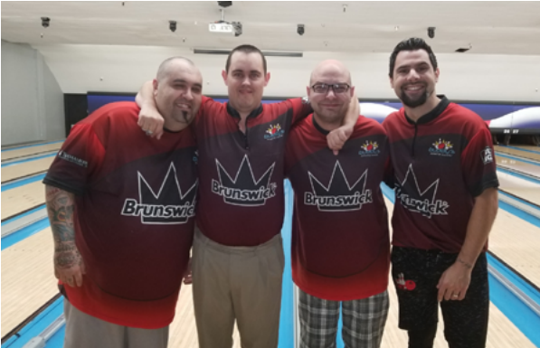
Buddy's Bowling Supply