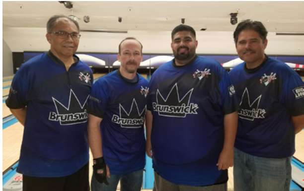
Cal Bowl - 3rd Place $8000