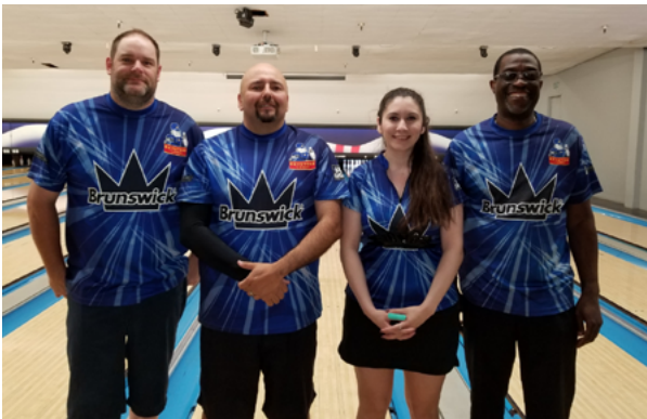
Keystone Lanes - 6th Place $5000