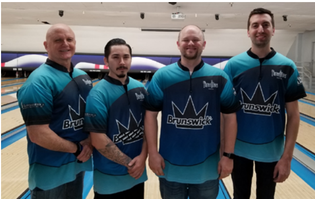
3 Olives Vodka - 5th Place $6000