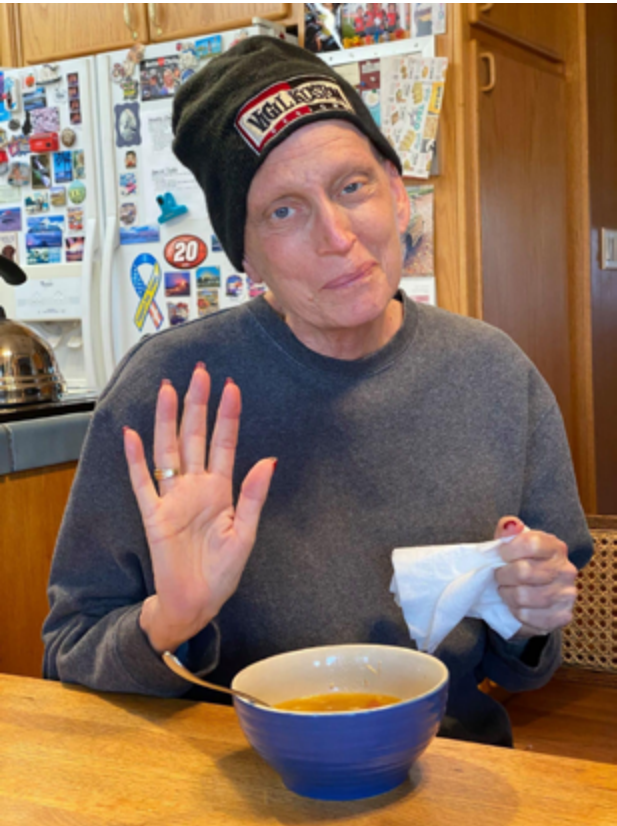
The photo is this week. Her birthday month, March 30th.

She is doing therapy in the mornings and resting in the afternoons. She was getting her hair back which is nice as she always enjoyed her hair, but it went away again during radiation, it will come back again. If you want to talk to her let me know I can arrange it, but she still has Chemo/Radiation brain fade where she has weak short-term memory, we are working on this.