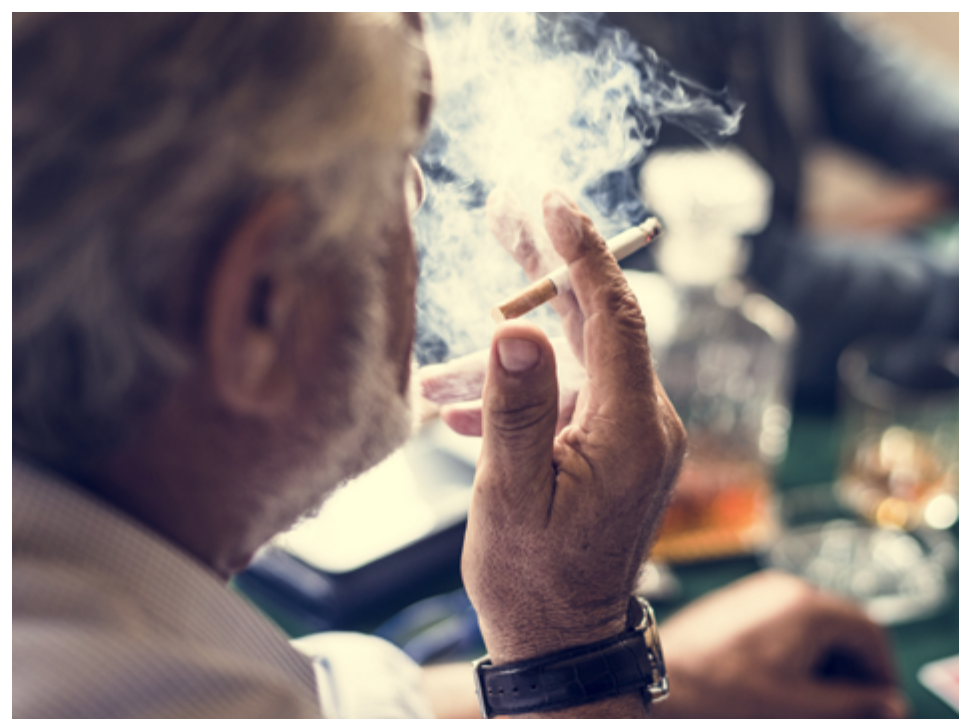
Starting April 1st - Smoking will be allowed back in centers.